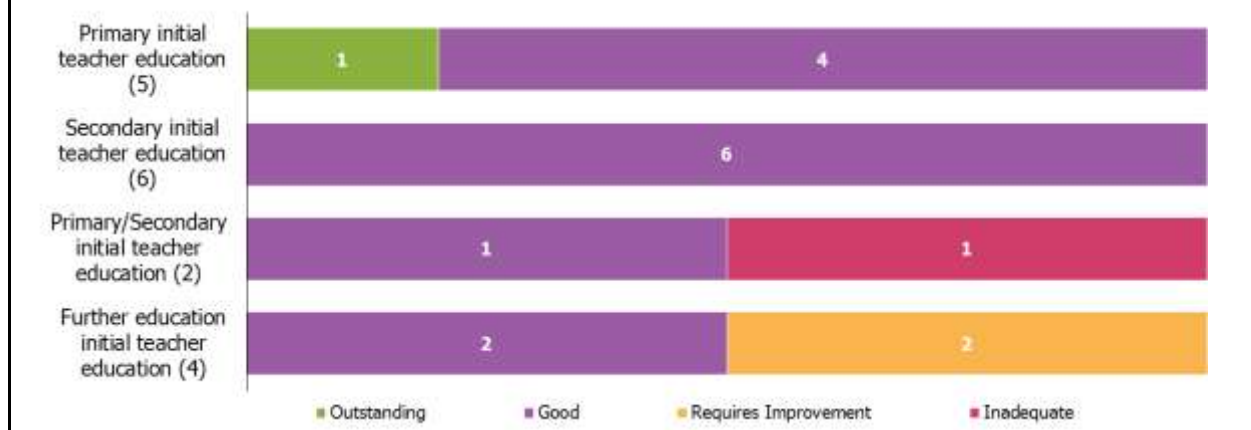
Chart 2: Overall effectiveness judgements from ITE inspections concluded between 1 September 2014 and 31 August 2015

Two providers judged to require improvement at their previous inspection were inspected again in 2014/15. The University of Leeds improved to good for both primary and secondary phases. Further education provision at the University of Essex was judged still to require improvement.